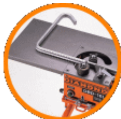
■ Extension working table(standard accessory)

■ This small unit may be carried in one hand but has all the attributes of its bigger brethren and can make a 180 degrees bend of a 16mm rebar in just 1.5 seconds.