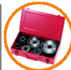
■ Roller kit (standard accessory).

■ For rebars of up to 20mm, the DBD-19L is similarly treasured. May we also suggest optional foot pedal and stand..