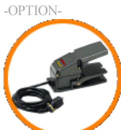
■ Foot pedal

■ Both the DBD-25X and the smaller, lighter DBD-25L are prized field models because of their proven durability and ability to bend 25mm rebars. This strong electrical-mechanical bender has two presets angle locks for repeating the same angle bends. Optional foot pedal and stand are available for all DBD series.