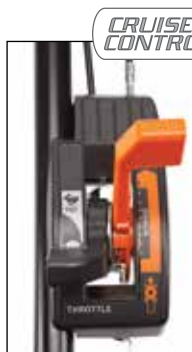
HRX Cruise Control