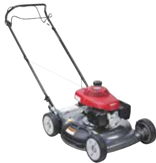
HRS216SKA Self-propelled, side discharge/mulcher with Auto Choke