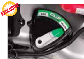
3-in-1 System With Clip Director® Mulch, bag or rear discharge with no parts to lose and no tools required. (HRR only)