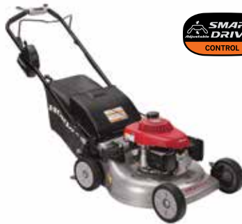
HRR216VLA Honda adjustable speed Smart Drive; Auto Choke; 3-in-1 bag, mulch, or discharge with Clip Director®; self charging Electric Start