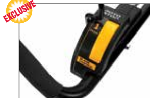
Honda Roto-Stop® Blade Stop System Start and stop the blade with engine running. (VYA only)