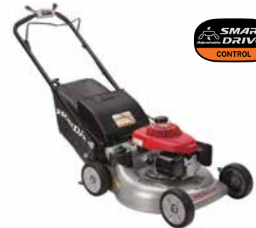
HRR216VKA Honda adjustable speed Smart Drive; Auto Choke; 3-in-1 bag, mulch or discharge with Clip Director®