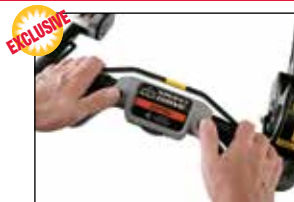
Honda Adjustable Smart Drive Control Easily control the speed when resting hands on the handlebars. (VKA, VLA & VYA only)