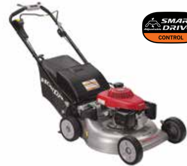
HRR216VYA Honda adjustable speed Smart Drive; Auto Choke with Adjustable Throttle Control; Honda Roto-Stop® Blade Stop System; 3-in-1 system with Clip Director®