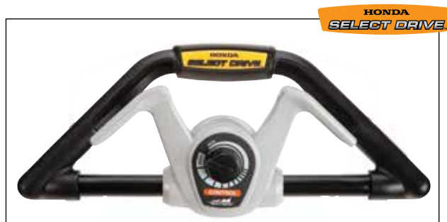
HRX Select Drive™ System

Honda transmissions offer time-saving features that allow you to walk at your own pace while easily adjusting ground speed to match mowing conditions.