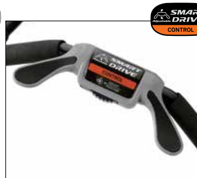
HRR adjustable Smart Drive