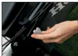
Easy Fold Quick Release Handle For simple height adjustment and storage. (HRR only)