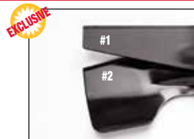
Exclusive Honda Twin Blade MicroCut® System Features twin blades for superior cut quality, mulching and bagging. (HRR only)