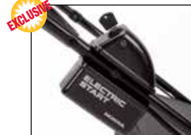
Self Charging Electric Start Under normal mowing usage, it is not necessary to charge or maintain the battery. (VLA only)