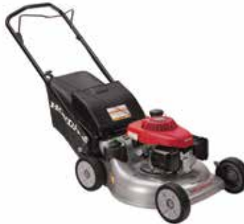
HRR216PKA Push type; Auto Choke; 3-in-1 bag, mulch or discharge with Clip Director®