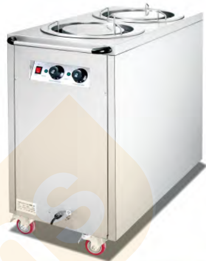
2- Head Electric Plate Warmer Cart