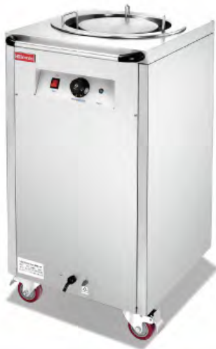
1- Head Electric Plate Warmer Cart