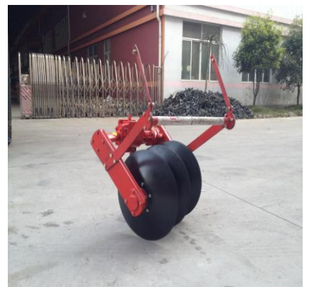
Driving Disc plough .