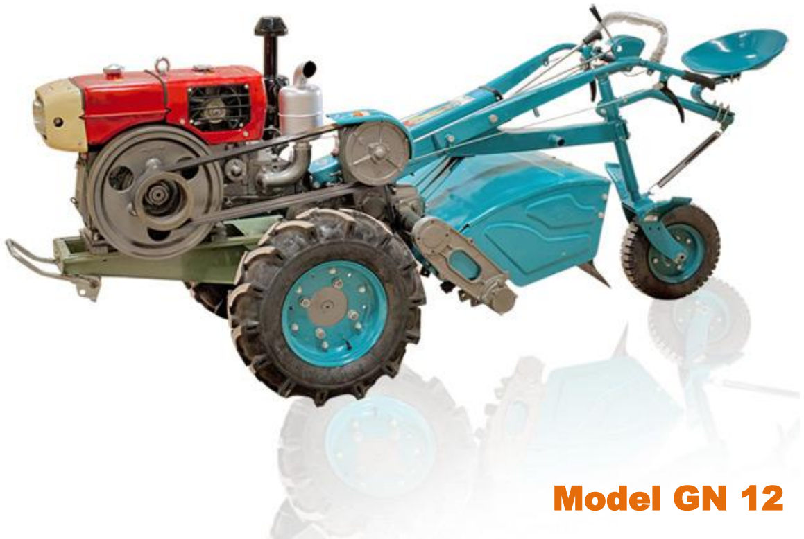
Model GN 12