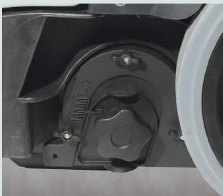
The main and side brushes are adjustable to ensure perfect pressure on the floor at all times and in all conditions.