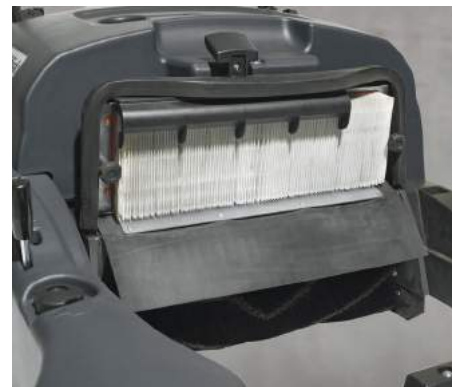
Thanks to the polyester filter the SW 750 can be used in both dry and humid areas.