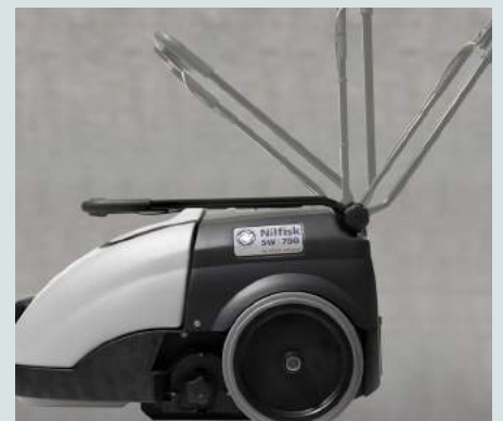
The handle is fully adjustable to suit each individual operator. It folds down completely to simplify storage.