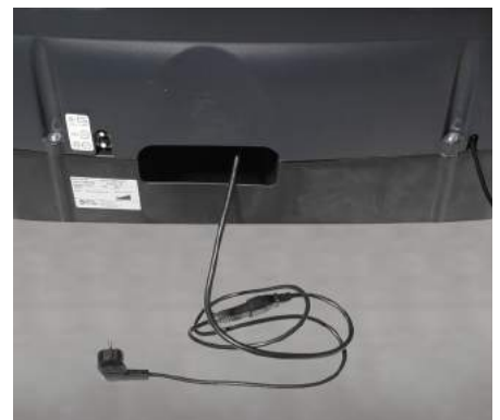
The plug-in onboard battery charger ensures continuous and hassle-free operation.