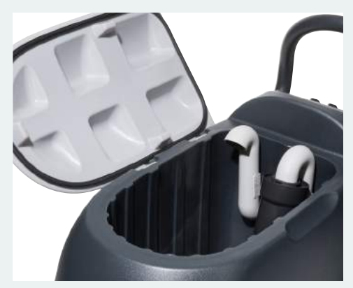
Large recovery tank and removable lid make it easy for you to clean and maintain the equipment. Fast and hygienic.

SC430 offers value for money and is available in a full package version that includes batteries, on-board charger as well as brush and squeegee – everything you need to get your cleaning going!