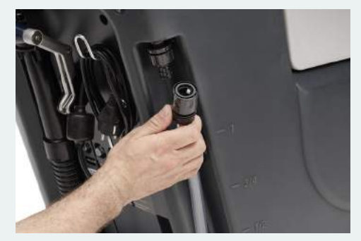
Solution hose is easy to disconnect and the solution tank can quickly be filled with water

SC530 comes in two versions: Non-traction and traction. The traction version grants easier maneuverability and allows effortless driving control for the operator.