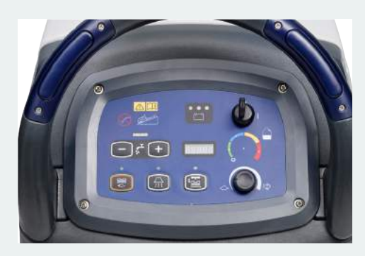
Solution flow regulation can be change from the driving position according to the floor type and level of dirt