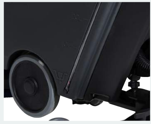
Built-in water level indicator.