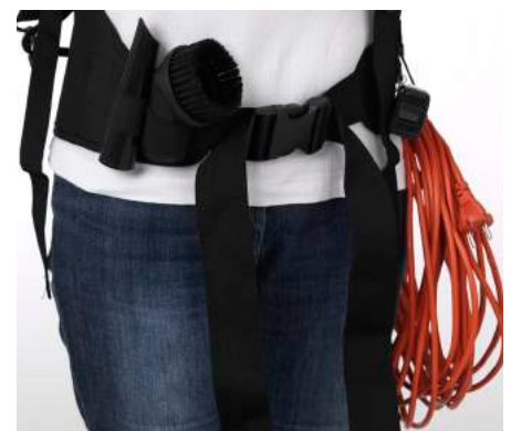
Accessories are stored on the belt for easy access