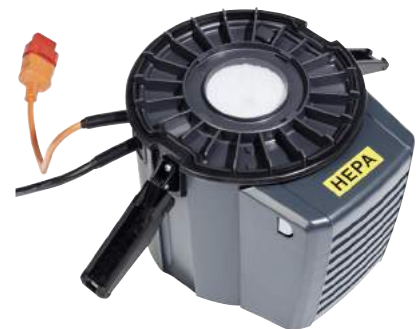
Easy to install HEPA exhaust filter as standard