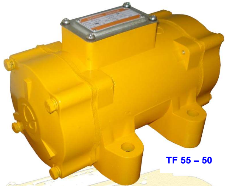
TF 55 – 50