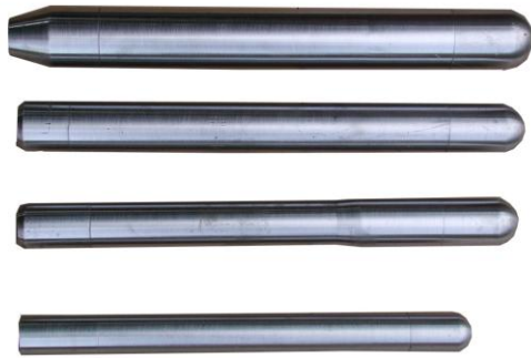
Concrete Vibrator TKLH-35, 45, 50, 60